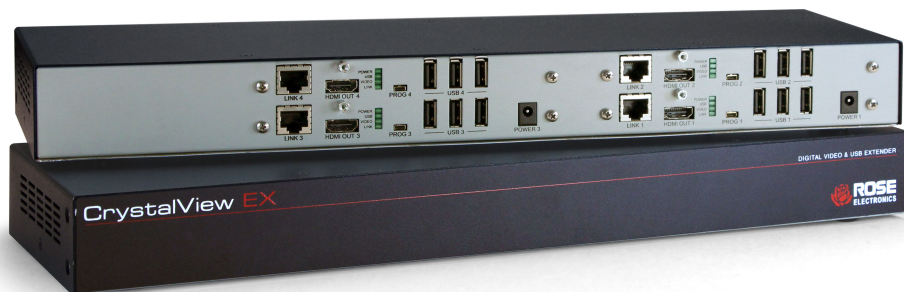
CrystalView EX HDMI quad port multi-unit model in wide chassis