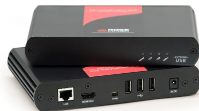
CrystalView EX HDMI compact model