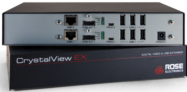
CrystalView EX HDMI dual port multi-unit model in mini chassis