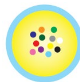
Single jacket typ.