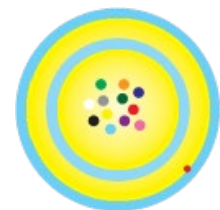
Double jacket typ.