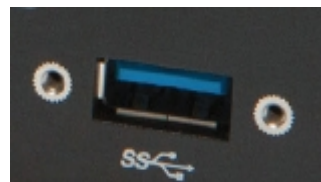
USB3 locking connector

The receiver unit features an integrated 2-port USB3.0 hub for simultaneous operation of 2 remotely located USB devices. These devices can be connected and locked to the receiver unit using USB3.0 type locking connectors for secure connection. The power connectors on the product are also secure locking type.