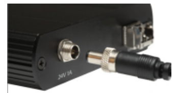
Locking power connector