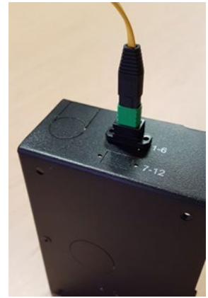
MTP / MPO