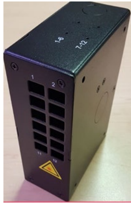
Side View (Wall mount holes)