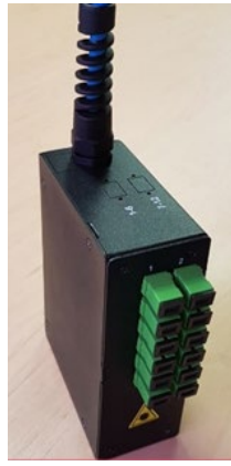
Top Cable Entry