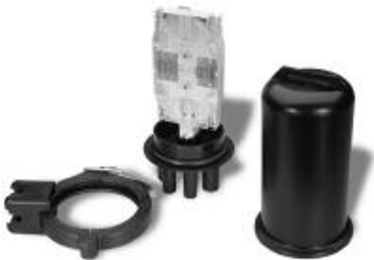
Part Number 140001 12-Fiber Application Ideal where space is limited and 12-fiber or less splices are required.