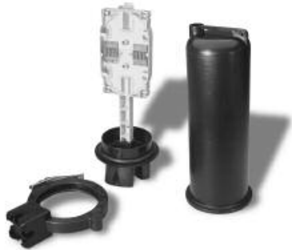
Part Number 140002 24-Fiber Application Accommodates up to 24-fiber splices

The 14000 Series Splice cases accommodate up to 24 fibers, utilizing one or two of the compact universal 12-fiber splice tray cassettes. They are ideal for low fiber count applications such as HFC nodes, FTTC ONU's, building interface and campus/LAN applications. Designed for ease of installation and excellent cable management, the 14000 Series products are the most economical low count fiber splice cases in the industry. The 140001 enclosure has 12-fiber splice capacity. The 140002 provides an extended length cover for added cable management and accommodates up to 24 fiber splices.