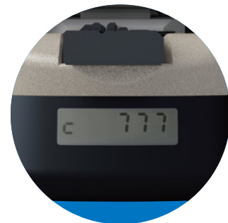
Smart cleave counter