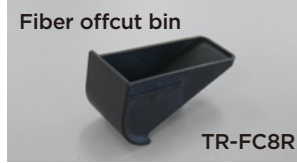
Fiber offcut bin